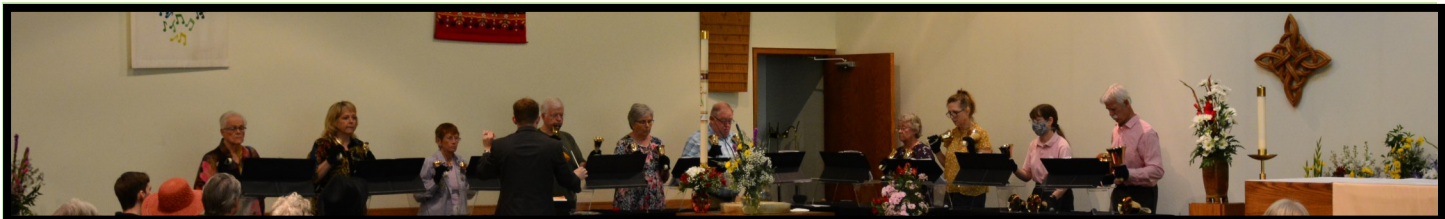
For The Beauty of the Earth Above, Ringspiration plays “For the Beauty of the Earth” and below, members of the different musical groups within the church sing it at the Fourth Annual Flower Festival, April 15.

WE NEED MORE MEMBERS MAKING MUSIC! PLEASE JOIN US!