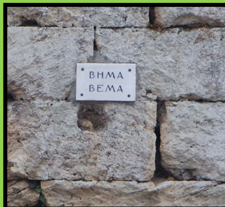
Figure 2 Closeup of the bema sign