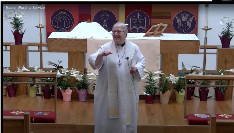
Easter Worship Service