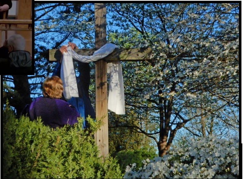
Below the two services on Easter Sunday—inside, and the outside Sunrise Service.