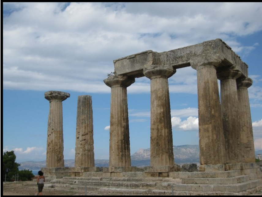
Figure 3 Temple of Apollo at Corinth