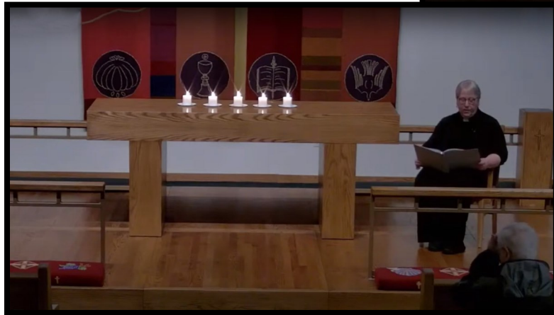
Good Friday Service at left and below, the re-draping of the cross.