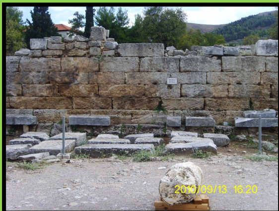
Figure 1 Bema in Corinth

In 2010, Judy and I went to Greece and Crete and were able to take the train up to Corinth. I thought you would enjoy seeing a couple of pictures of the Bema in Corinth where Paul gave his sermons (Figures 1 and 2). A bema is an elevated platform used as an orator's podium in ancient Athens. The term also refers to the raised area in a sanctuary or in Jewish synagogues where the Torah is read. As a historical note, Figure 3 shows ruins from the Temple of Apollo at Corinth.