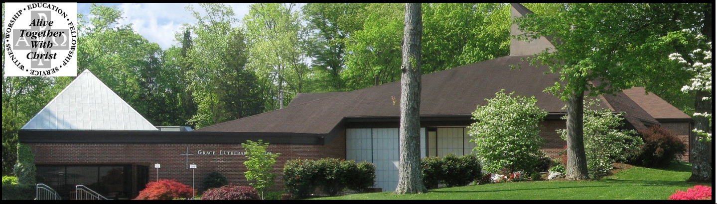
February 2024 Grace Lutheran Church